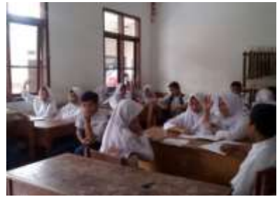
Figure 3 Student pose question in Reciprocal Teaching Approach

The study found that many students of RTA and conventional teaching attained at low grades (less than 60% out of ideal score) on 2 items of MRA test those were about generalization and to excecute calculation based on agreed to principle and rules. This finding was different with findings of other previous studies Bernard, M. and Rohaeti, E (2016), Rohaeti, E.E., Budyanto, A.M., Sumarmo (2014), Setiawati (2014), Sumarni, C. and Sumarmo (2017), Wulanmardhika (2014) that students obtained at low grades on MRA.