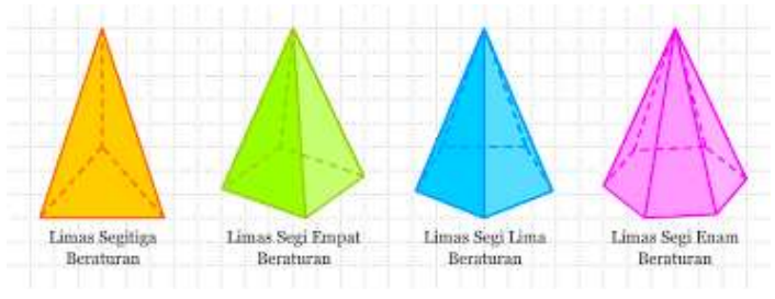
Figure 1. Several Types of Pyramid

Determine how many sides, how many flanks, how many points in pyramide n- sides? Explain how to ditermine your answer.