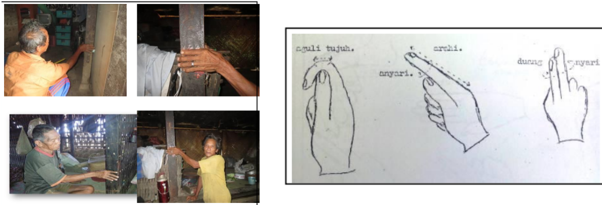
Figure 2. Ethnomathematics: Predicting the Average Height of Bali Mula Ancestors Using Linear Regression

Musi River, Palembang. The mathematical concept used is counting such as calculating the number of searchers, wages, and determining the price of “treasure”.