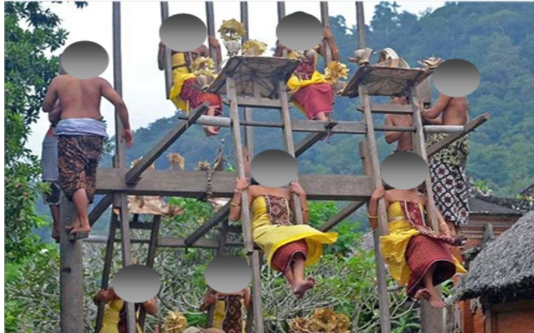
Figure 4. Ayunan Jantra in Bali

and sometimes at the bottom (difficulty). The constantly rotating motion of the swing symbolizes a life that never stops spinning. In addition, this philosophy also teaches that humans must be ready to face all positions in life. When at the top, humans are taught to be grateful and humble, while when at the bottom, humans must be patient and keep trying. Through this tradition, the values of life are symbolically instilled in the teenagers who participate in the swing. Another philosophy is the meaning of unity and cooperation. The process of making and using the Ayunan jantra involves many parties, including male teenagers (teruna) and female teenagers (daha), as well as traditional leaders and the general public. The cooperation in making, swinging and maintaining the swing symbolizes that a harmonious community life can only be achieved through collaboration and togetherness.