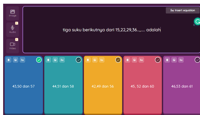
Figure 3. Display of the process of entering questions on quizziz

Figure 3 is the process of entering questions into quizziz in the form of multiple choice questions, then after all the questions have been entered into quizziz, the appearance is as follows: