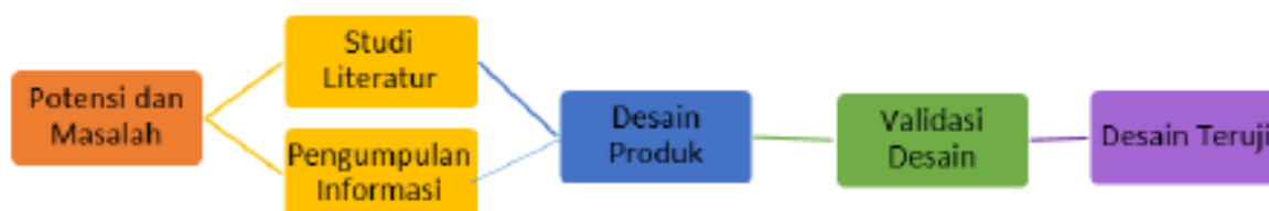
Figure 1. research steps

The purpose of this research is to develop modules on sequences and series materials with the help of quizziz media to see students' mathematical understanding abilities. This study used the level 1 research and development method. The R&D method was chosen on the consideration that the activity steps in the existing media were at the request of the researcher. Here are the research steps