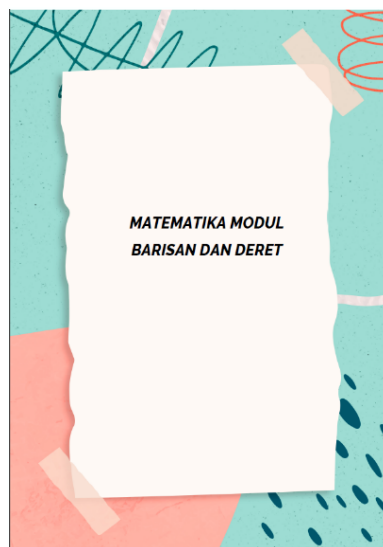
Figure 2. Sequence and Series Module