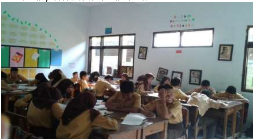
Figure 2. Process of Reconstruction and Contribution of Students