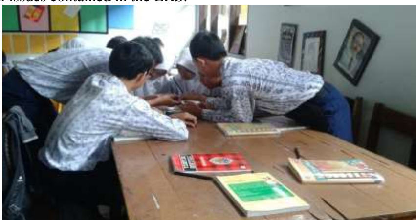
Figure 1. The Process of Observing, and Resolving, Contextual Problems Mathematical