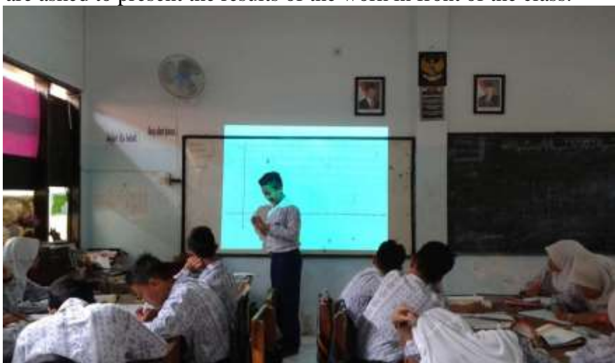
Figure 3. Each Representative Presenting the Answers Problem on LKS