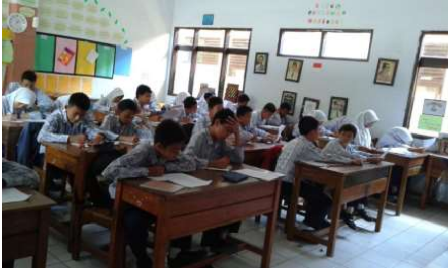
Figure 4. Interesting Conclusions and Evaluations

Based on the experience experienced by researchers during the research process, researchers found several advantages of using realistic mathematical approaches, including being able to provide clear understanding to students about the relationship between mathematics and everyday life and about the usefulness of mathematics in general. For humans, students become more active in expressing their opinions because learning is related to the real life of students, students are active in solving problems in their own ways, and with this approach students are not only easy to master the concepts and subject matter but also not quickly forget what they have obtained that.