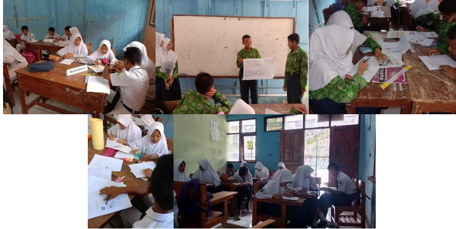
Figure 3. Learning Activities with Peer Tutor Model

peer tutors are as follows (see figure 3): 1) some students do not want to be taught by their peers who are tutors; 2) students who become tutors will feel burdened; 3) learners who are not serious about learning, in general, will only copy the answers of a group of friends because they feel that someone already bears the burden of learning, namely the tutor; 4) the concept of the material delivered by the tutor is not necessarily true; 5) some groups have not been able to accept group members who have been fully determined.