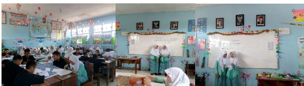
Figure 4. student performance cycle III

During the learning process, students were seen to be more enthusiastic than cycle I. Students were enthusiastic in completing the worksheets provided by the teacher in groups, they discussed. When facing difficulties, they do not hesitate to ask the teacher. After the group discussion is over, representatives of each group present their group work in front of the class. In the third cycle, still using the constructivism approach but with different material. Students in groups complete their group worksheets. Like in picture 4 below.