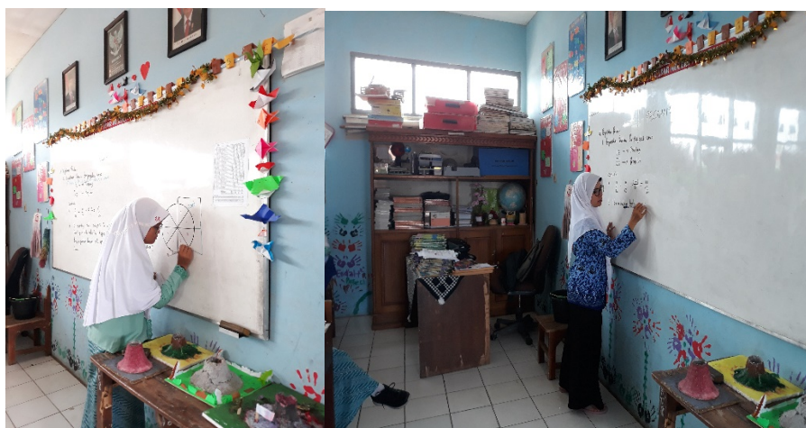
Figure 2. student performance cycle I

In cycle II (see figure 3), the teaching and learning process is carried out using a constructivism approach, where students construct their own knowledge. As stated by Suciati et al (2016) the constructivism approach in the world of learning is associated with constructing or shaping meaning from the learning experiences lived by students, that knowledge is shaped by students based on the experiences they have lived in and not given by the teacher. In other words through the constructivism approach students are required to play an active role in the learning process, students sit in groups to conduct discussions and experiments to solve the problems presented by the teacher as a facilitator. The ability to understand can be seen when students can solve mathematical problems.