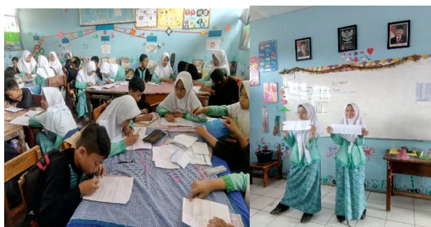
Figure 3. student performance cycle II

In cycle II (see figure 3), the teaching and learning process is carried out using a constructivism approach, where students construct their own knowledge. As stated by Suciati et al (2016) the constructivism approach in the world of learning is associated with constructing or shaping meaning from the learning experiences lived by students, that knowledge is shaped by students based on the experiences they have lived in and not given by the teacher. In other words through the constructivism approach students are required to play an active role in the learning process, students sit in groups to conduct discussions and experiments to solve the problems presented by the teacher as a facilitator. The ability to understand can be seen when students can solve mathematical problems.