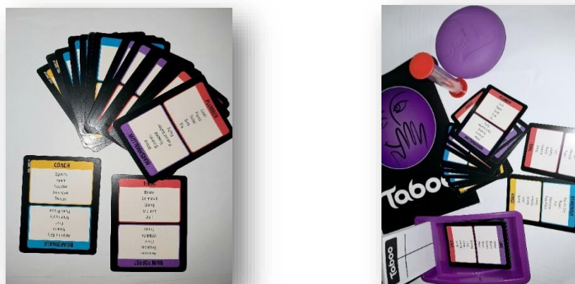
Figure 2. Image Media

This study is an R&D project designed to develop a Taboo game as a teaching tool for improving speaking skills among 8th-grade students at MTs Durriyyatina. The purpose of this development is to create a learning media that enhances students' interest in learning speaking skills, enabling them to learn in an engaging and enjoyable way through play. In addition to the learning model, this research also produces a product in the form of Taboo game learning media, specifically cards. Each card features a word that players must guess and describe, but the word itself cannot be mentioned, making it "taboo." The cards are printed using Nothin' But Paper. This Taboo game learning model serves as an effective medium for teaching speaking skills. The images of the media are shown below.