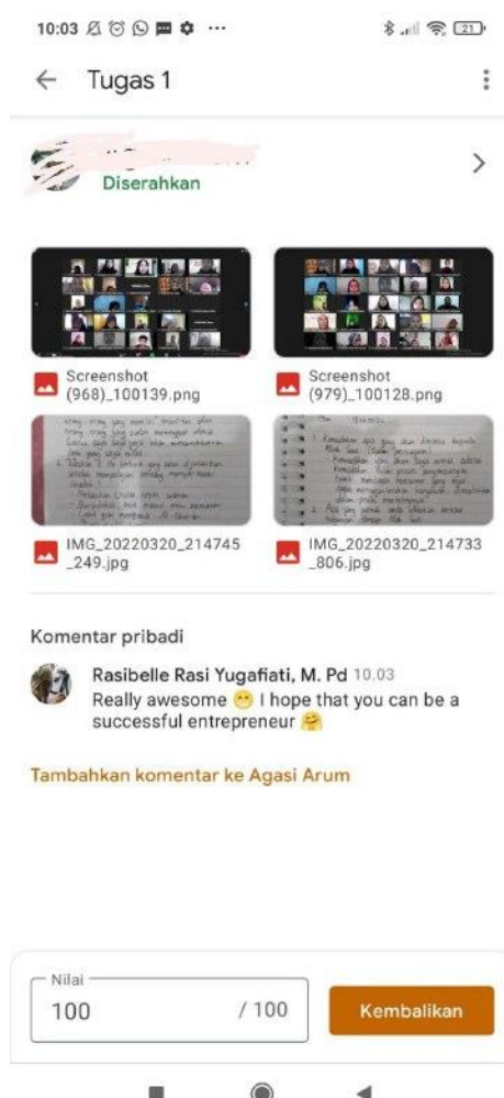
Figure 2. Students Tasks in English Entrepreneurship

The students performed a good job on the task, as shown in the Picture 2. They went to online class. They also snapped screenshots during lectures to demonstrate that they were here to learn about entrepreneurship. Within each assignment, there were several attachments. Even the students' grades could be described as perfect. It demonstrated that students wanted to put what they've learned into practice. Following the student interviews, they stated that the entrepreneurial material used during the COVID-19 epidemic was highly compelling. They became enlightened and began trading, among other things, via Whatsapp status updates.