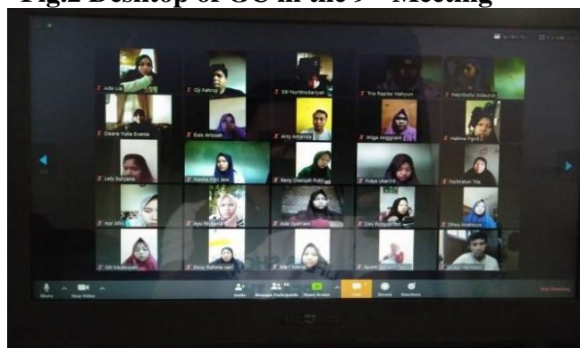
Fig.2 Desktop of GC in the 9 th Meeting

In the Fig.2, we can see the display of Zoom in the ninth meeting. In this meeting, the students are presented the materials about How to Write Methodology . The materials cover the tips from