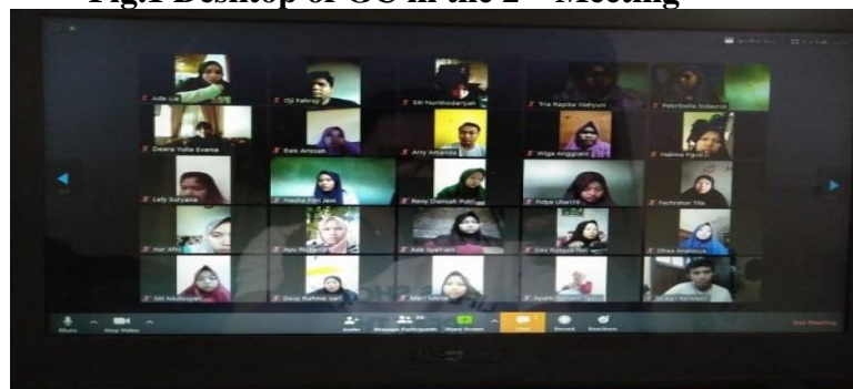
Fig.1 Desktop of GC in the 2 nd Meeting

In the Fig.1, we can see the display of Zoom in the second meeting. In this meeting, the students are presented the materials about How to Write an Abstract . The materials cover the tips from sources books to be understood by them. In understanding the materials, it can be said the students' comprehension is already good. They are able to read the materials. They also are able to answer questions, both in question-and-answer session and when they are told to write a sentence of an abstract. The means of their writing results is 60. It means that their reading and writing skills are good enough.