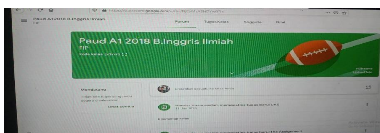
Fig.3 The Display of GC in UAS (Last Semester Test)

In the Fig.2, we can see the display of Google Classroom in the eighth meeting. In this meeting, the students are presented the materials of Mid Term Test to be solved by them. The test covers the materials since from beginning to the seventh meeting. In understanding the materials, it can be said the students' comprehension is already good. They are able to read the materials. They also eventually are able to answer the test completely. On the average of grade ranging from 10 – 100, their means is 60.