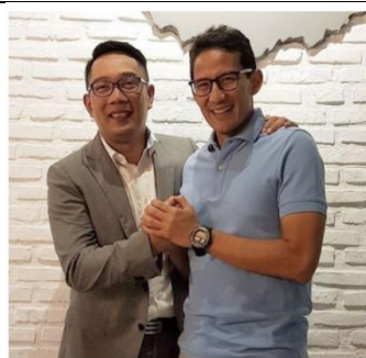
Sandiaga Uno dan Ridwan Kamil.