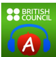
Figure 1. British Podcast Application

One of the famous internet platform is Google. Google has been providing millions of source verified credentials or applications with educational organizations such as the British Council's. British Council has launched several applications of learning English through movies, podcasts, games and quizzes. The application can be downloaded via Google playstore, Apple store and windows Phone store. Based on these issues, researchers did the research on the use of applications from British Council to improve listening ability using English Podcast Application. This application focuses on the capability listening of the users. There are several features on this application, the most important is the audio and scrip regarding some general topic which can be downloaded for free and played offline, then there are tips on learning English