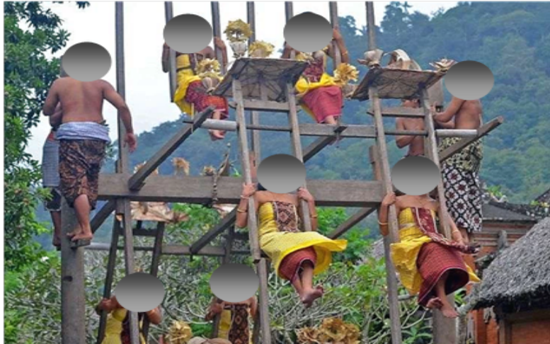
Figure 4. Ayunan Jantra in Bali

and sometimes at the bottom (difficulty). The constantly rotating motion of the swing symbolizes a life that never stops spinning. In addition, this philosophy also teaches that humans must be ready to face all positions in life. When at the top, humans are taught to be grateful and humble, while when at the bottom, humans must be patient and keep trying. Through this tradition, the values of life are symbolically instilled in the teenagers who participate in the swing. Another philosophy is the meaning of unity and cooperation. The process of making and using the Ayunan jantra involves many parties, including male teenagers ( teruna ) and female teenagers ( daha ), as well as traditional leaders and the general public. The cooperation in making, swinging and maintaining the swing symbolizes that a harmonious community life can only be achieved through collaboration and togetherness.