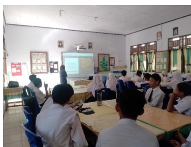
Figure 1. Delivery of material through Quizizz

The first cycle of game-based learning with Quizizz as can be seen in Figure 1, the photo depicts the delivery of learning materials using the Quizizz application. Teachers present the material in the form of interactive quizzes that students can access through their respective devices. In this way, the process of delivering material is no longer one-way, but more engaging because students are actively involved. revealed several areas for improvement, such as student guidance, planning, time management, and command delivery. This provided a basis for reflection and refinement in the next cycle so that the game-based learning model could be used to improve student achievement.