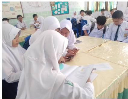
Figure 2. Quizizz-based game

In addition, students gain an understanding of how fun and competitive lessons are conducted. Game-based learning models have been proven to increase student focus and enthusiasm for learning, especially in answering questions related to data presentation material. Quizizz is an entertaining and enjoyable tool for testing students' understanding directly, figure 2 shows a learning activity that uses Quizizz-based games. In this activity, students take part in interactive quizzes that are designed like games. Each student can access the questions through their own devices, then answer quickly to get the highest score. The use of Quizizz makes the learning atmosphere more lively because students not only focus on the correct answers, but also enjoy the visual display, point system, and leaderboard, which encourage healthy competition. Thus, learning activities are no longer monotonous, but more enjoyable and motivate students to participate actively.